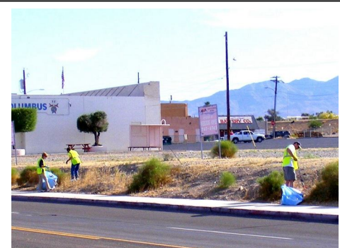
Lake Havasu Road Cleanup